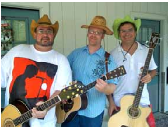
music by The Cowtown All-Stars, & catching up with many friends