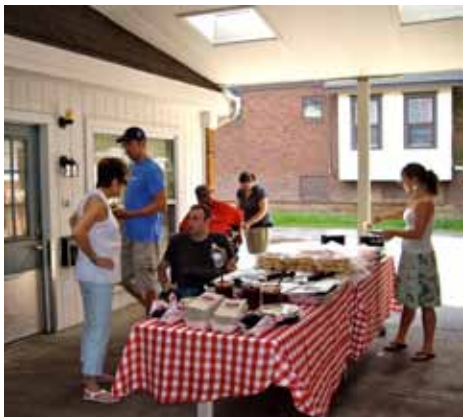
We enjoyed City Barbeque,