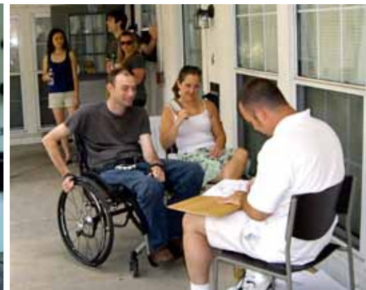
caricatures by artist Tom Gluck